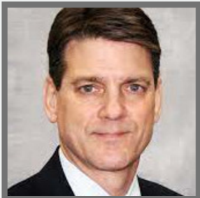
Scott White Virginia Insurance Commissioner